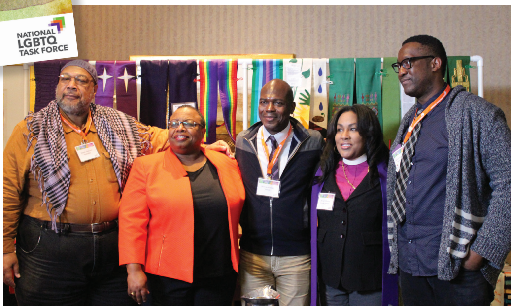
Leaders of faith pictured at the summit in front of the Shower of Stoles.