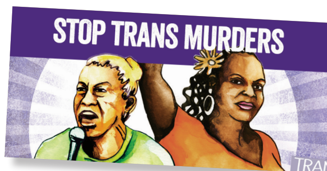
A poster that's part of the #StopTransMurders public awareness campaign.