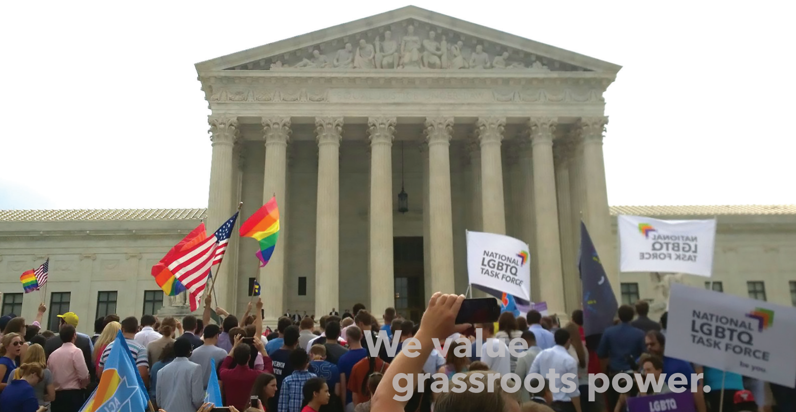
Task Force supporters rally at the United States Supreme Court.