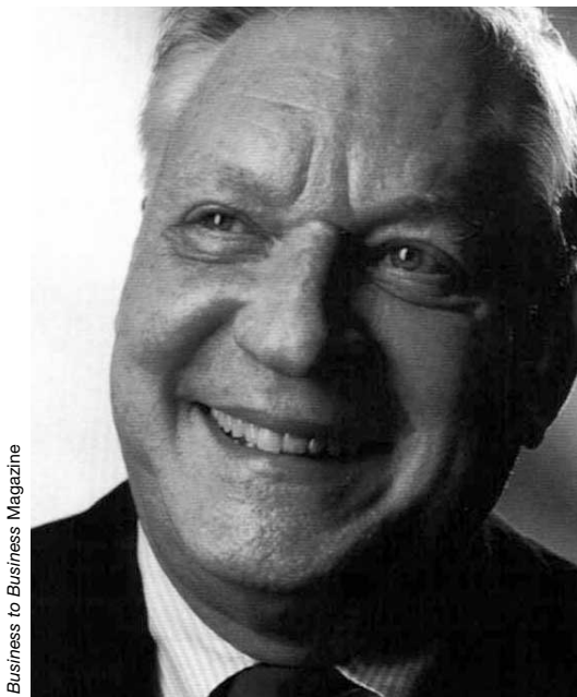
Business to Business Magazine